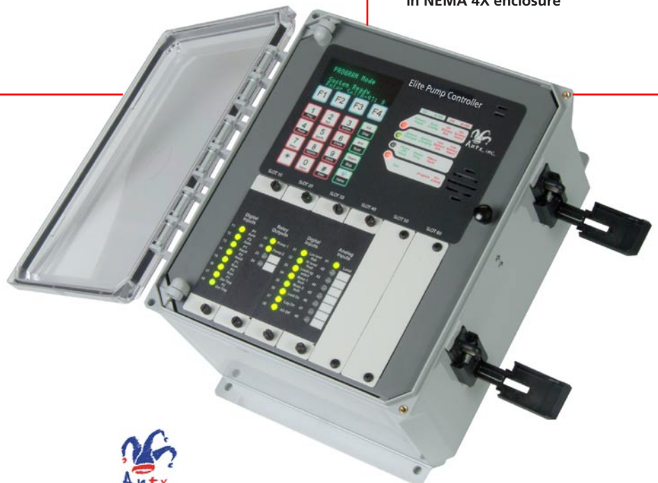
Antx Elite Pump Controller in NEMA 4X enclosure

Manage your pumps remotely by telephone or from your PC.